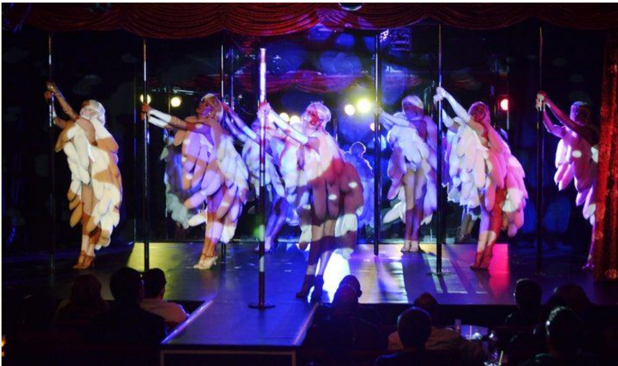
Let the original topless revue show you how it's done.

The dancers go through 18 costume changes per show. Though many of the costumes are quite skimpy, the sheer volume of them requires a seamstress on staff. Luckily, Crazy Girls is fortunate to have a former dancer as their seamstress. She used to dance in the show in the '90s so you could say she knows the costumes inside and out.